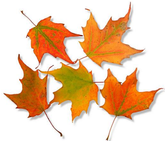
Figure 3- Fall leaves